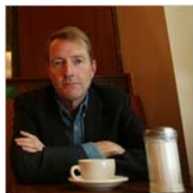
Creating a Don Quixote of the Cheap Motel Circuit