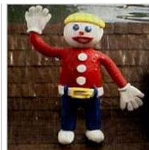
Mr. Bill Returns (in One Piece) to Pitch Debit Card