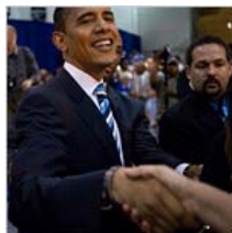
Obama, Awaiting a New Title, Hones His Image