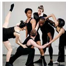
A Five-Day Banquet of Science and Its Meanings