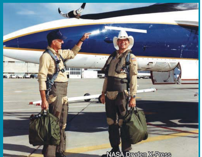
NASA Dryden X-Press