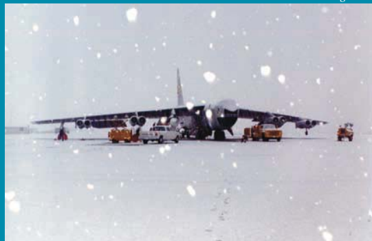
ECN 32107 NASA Dryden X-Press