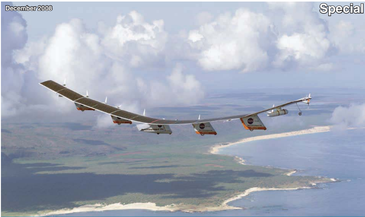
EC03 0152-466 NASA's Helios Prototype electrically powered flying wing began a checkout flight June 7, 2003, from the Navy's Pacific Missile Range Facility on the Hawaiian island of Kauai.

At right, the Highly Maneuverable Aircraft Technology subscale and remotely piloted aircraft demonstrated advanced fighter technologies that have been used in the development of many modern high-performance military aircraft.