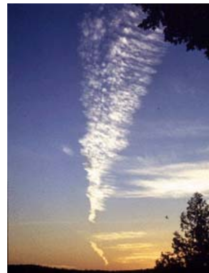
Figure 1. Dissipating jet contrail.

The ratio of the cross-polarized to the co-polarized components of the backscattered light is called the depolarization ratio. A non-zero depolarization ratio indicates the presence of non-spherical ice crystals. Lidar observations of regular cirrus and contrails often show large depolarization ratios. In order to interpret these measurements quantitatively, in terms of particle size and shape, the scattering of light by non-spherical ice crystals has to be calculated in a computer model. Until recently, such calculations could only be made for large crystals, and it was believed that the observed large depolarization ratios always