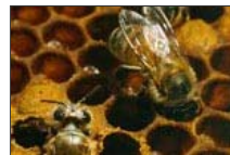
Photo of the Day: Social Workers

Visit the inside of a beehive and watch a baby worker bee emerge from its comb.