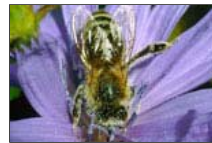
Photo of the Day: Pollen Count

See a pollen-coated honeybee feeding at a bright purple chicory flower.