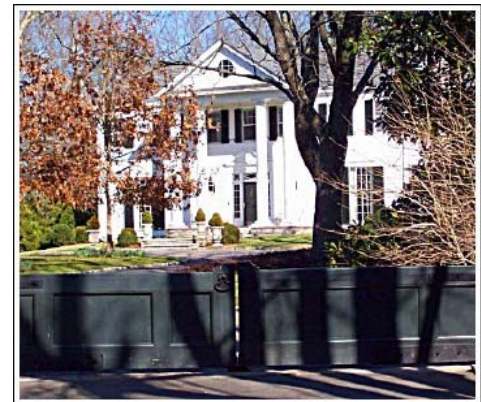
Al Gore's Nashville mansion

Al Gore defends his extraordinary personal energy usage by telling critics he maintains a "carbon neutral" lifestyle by buying "carbon offsets," but the company that receives his payments turns out to be partly owned and chaired by the former vice president himself.