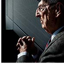
Pioneer Reflects on Reproductive Medicine