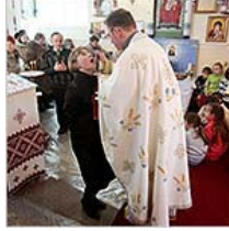
A Flock Grows at Home for a Priest in Ukraine