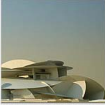
Celebrating the Beauty of the Desert Landscape