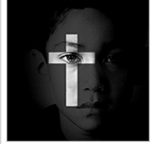
Op-Ed: Benedict's Fragile Church

Home | World | U.S. | N.Y. / Region | Business | Technology | Science | Health | Sports | Opinion | Arts | Style | Travel | Jobs | Real Estate | Autos | Back to Top Copyright 2010 The New York Times Company | Privacy | Terms of Service | Search | Corrections | RSS | First Look | Help | Contact Us | Work for Us | Advertise | Site Map