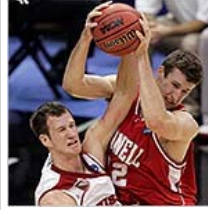
A Starter for Kentucky Now on Cornell's Bench