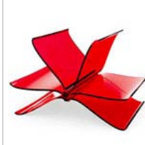
Fluid Designs at the Milan Furniture Fair