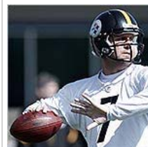
Egan: Nike's Women Problem