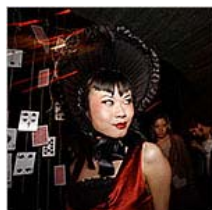
Priestess of the Night