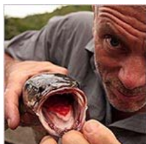
All Creatures Great and Repulsive