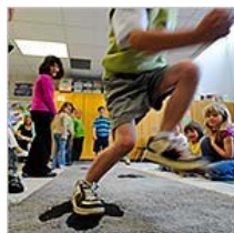
Museums Take Their Lessons to the Schools