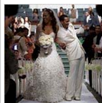
Weddings and Celebrations