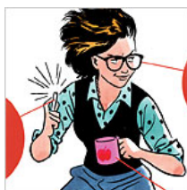
Building a Better Teacher