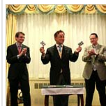
No Rabbit in His Hat, But Tricks up His Sleeve