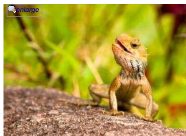
Alert juvenile chameleon sunning on a rock. Keeping warm isn't the only reason lizards and other cold-blooded critters bask in the sun.