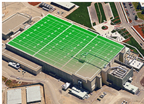
National Ignition Facility The laser and target area building at the National Ignition Facility in Livermore, Calif. is 10 stories tall and the size of three football fields

Sound too good to be true? Well, so far it has been. The massive energy gain from controlled fusion is a prize that scientists have sought for decades. Yet to date, no laboratory has successfully pulled off a controlled, small-scale fusion reaction in which the energy created by the reaction exceeded the energy needed to generate the reaction.