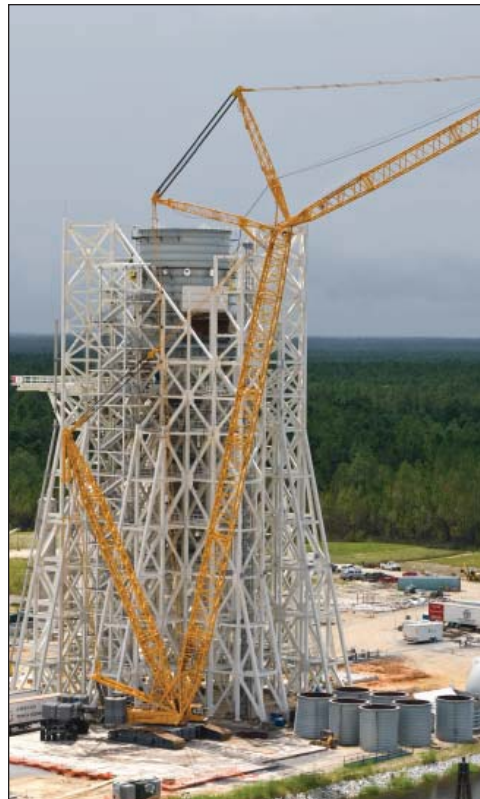
A-3 Test Stand construction continues at Stennis.

• B-1/B-2 Test Stands. The B Test Complex consists of a dual-position, vertical, static-firing test stand, also