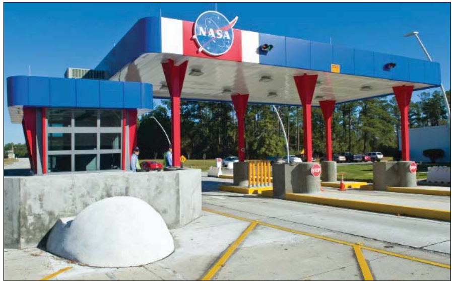
(Bottom photo) In 2010, Stennis completed total rebuilds of the north and south (as shown) security gates to enhance appearance and increase safety.