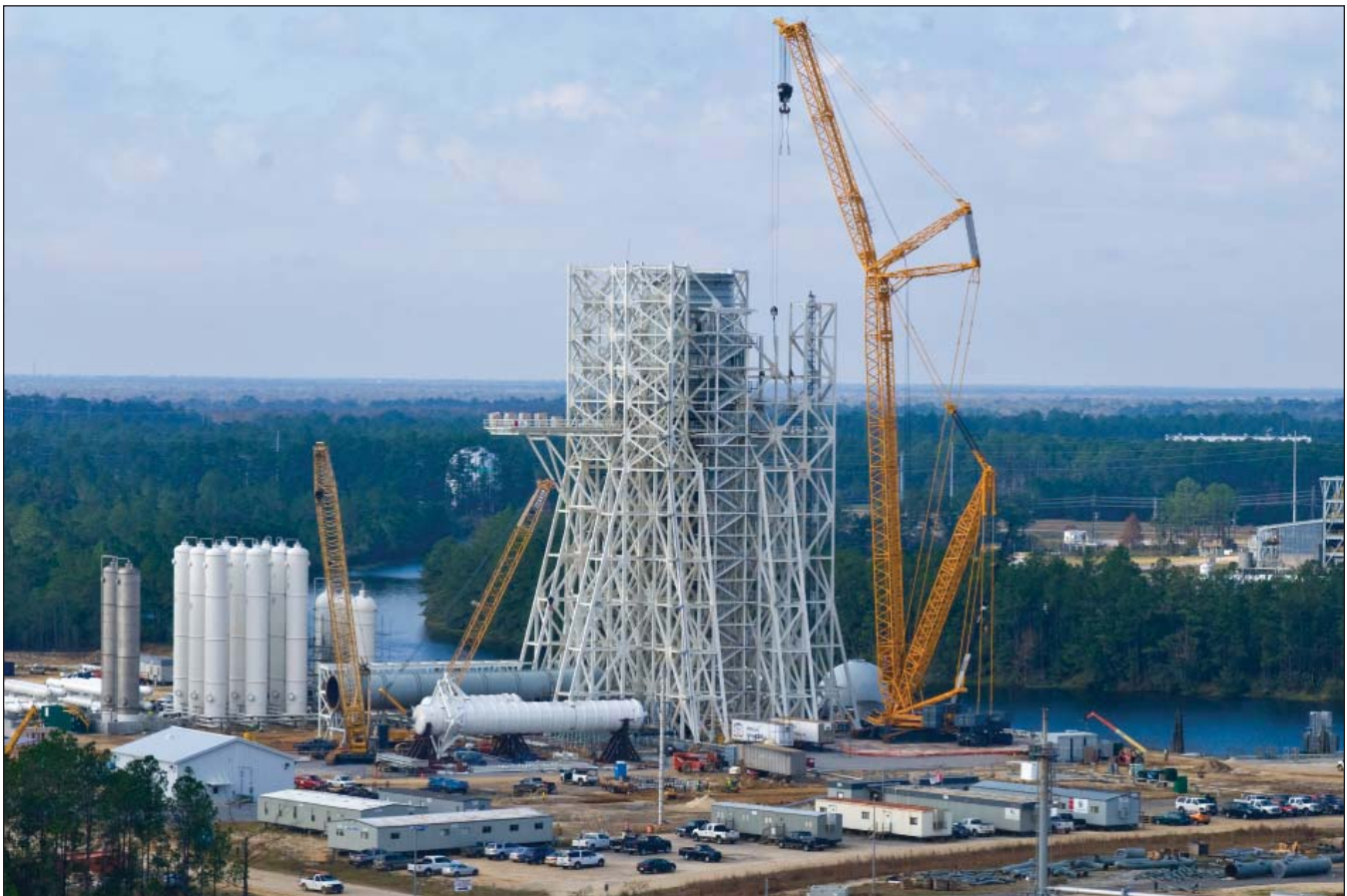
When complete, the new A-3 Test Stand at Stennis will allow testing of rocket engines at simulated altitudes up to 100,000 feet.