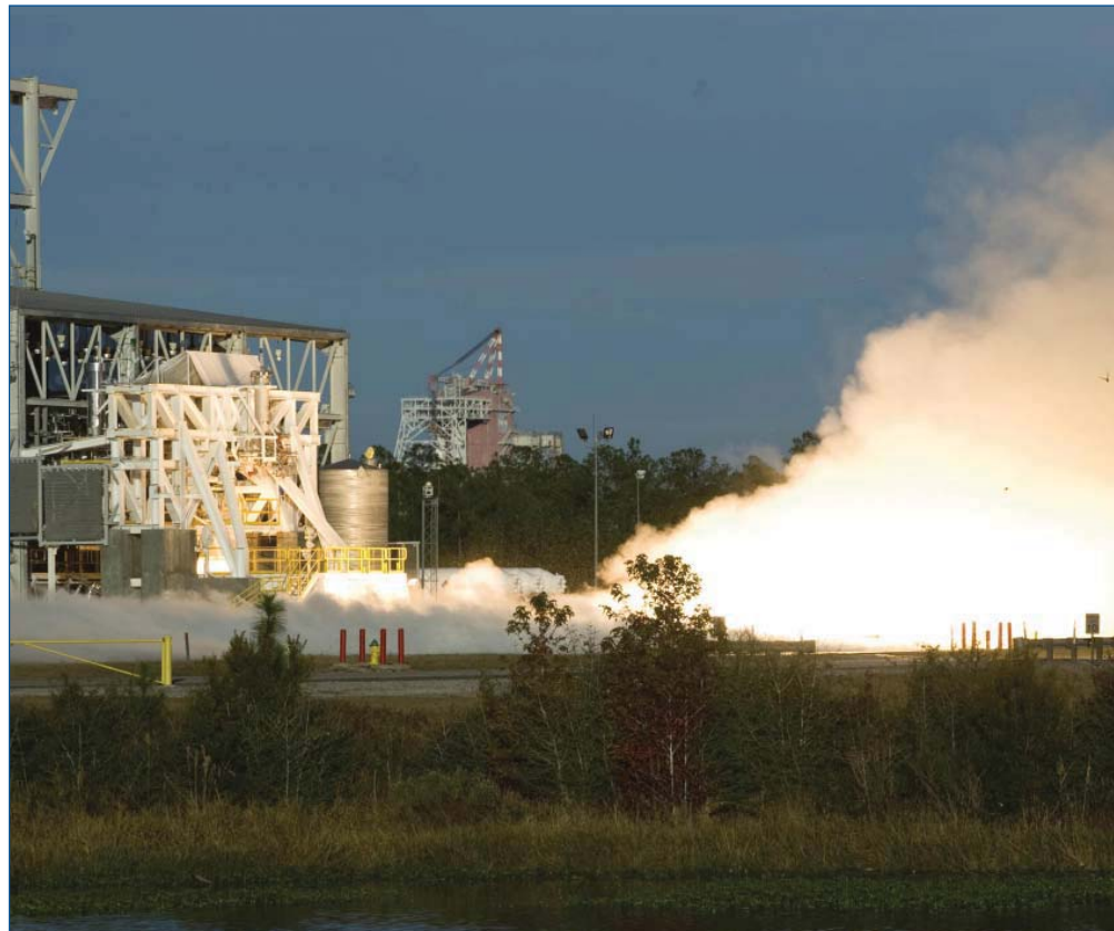
Fire and steam signal a successful test firing of Orbital Sciences Corporation's Aerojet AJ26 rocket engine Nov. 10. AJ26 engines will be used to power Orbital's Taurus II space vehicle on commercial cargo flights to the International Space Station. The 10-second test fire on Nov. 10 was the first of a series of scheduled verification tests.