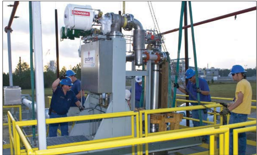
Stennis employees install a chemical steam generator at the E-2 Test Stand. After testing the unit, it will be installed on the A-3 Test Stand under construction onsite.

A new engine. In 2010, Stennis led the way in working with commercial companies to develop space travel capabilities, partnering with Orbital Sciences Corporation to test Aerojet AJ26 engines to power commercial cargo flights to the International Space Station.