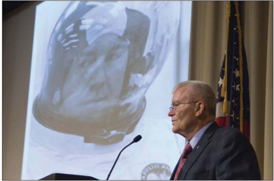
(Top photo) Apollo 13 astronaut Fred Haise recounts his experiences on that mission during a visit to Stennis Space Center on April 20 to mark the 40th anniversary of the historic flight.

Milestones. The Stennis community marked numerous milestones in 2010. Construction on the new INFINITY science center moved ahead, with a “topping out” ceremony held in mid-November. The Public Affairs Office continued a range of outreach efforts across the region, while the Education Office continued longstanding outreach efforts like Astro Camp and annual FIRST (For Inspiration and Recognition of Science and Technology) LEGO and robotics competitions. The office also opened a new Educator Resource Center onsite and produced its first-ever curricula, a Mass vs. Weight study and a Spaced Out Sports package that included a challenge for students to design games that could be played on the International Space Station.