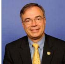
Rep. Andy Harris (R-MD), Chairman

The Subcommittee on Energy and Environment has legislative jurisdiction and general oversight and investigative authority on all matters relating to energy research, development, and demonstration and projects therefor, commercial application of energy technology, and environmental research, including: Department of Energy research, development, and demonstration programs; Department of Energy laboratories; Department of Energy science activities; energy supply activities; nuclear, solar and renewable energy, and other advanced energy technologies; uranium supply and enrichment, and Department of Energy waste management and environment, safety, and health activities as appropriate; fossil energy research and development; clean coal technology; energy conservation research and development; energy aspects of climate change; pipeline research, development, and demonstration projects; energy and environmental standards; energy conservation, including building performance, alternate fuels for and improved efficiency of vehicles, distributed power systems, and industrial process improvements; Environmental Protection Agency research and development programs; National Oceanic and Atmospheric Administration, including all activities related to weather, weather services, climate, the atmosphere, marine fisheries, and oceanic research; risk assessment activities; and scientific issues related to environmental policy, including climate change.