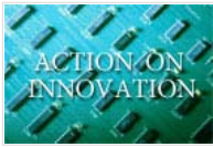
Action on Innovation