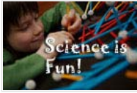
Science is Fun!