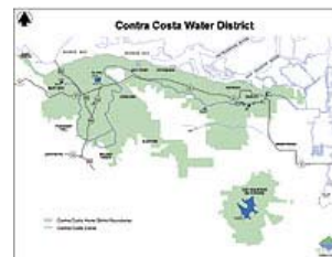
Map of CCWD Service Area