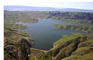
Aerial Photo of Los Vaqueros Reservoir

For more information on CCWD water quality, Click here