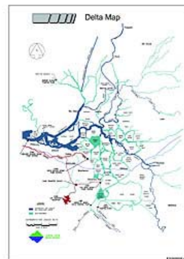
Sacramento/San Joaquin Delta Map

Most of these agencies can also draw groundwater from wells or surface water from their own reservoirs or the Sacramento or San Joaquin rivers as supplemental supplies.