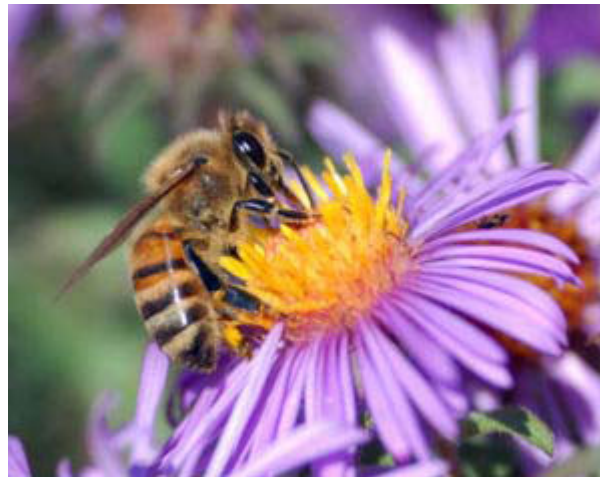
Western honey bee, or European honey bee ( Apis mellifera ), gathering pollen from purple aster. 34% of American honey bees in commercial hives have disappeared this spring of 2008, in a persistent mystery known as “colony collapse disorder.”