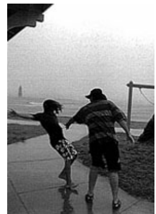
The Air Force believes it have the ability to create storms that can thwart r