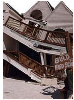
Some storms release the equivalent of several nuc

The report makes the limitations of the military's current weather-predicting abilities disturbingly