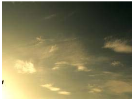
Precipitation Stimulation Project of New York 1950"