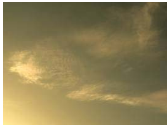
"South Dakota Seeding Evaluations 1965- 1971