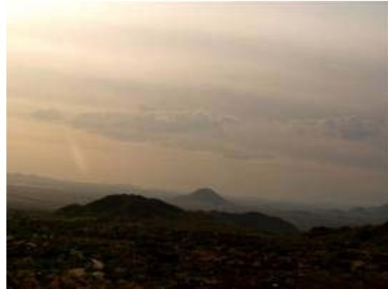
Impacts of Urban Modified Precip. on Man's Activities 1977