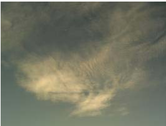
"Cloud Seeding In California"