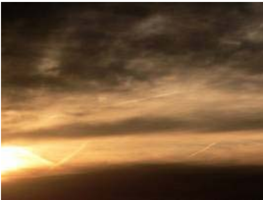
So, you still think nothing's going on up there?....