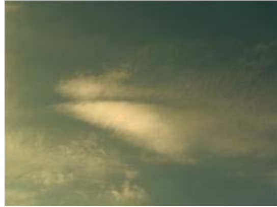
Cloud Seeding Of Mexico City 1974-76"