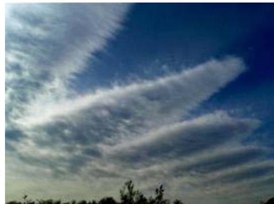
"Characteristics of Aerially Released AgL Plumes In Alberta" pub 1990