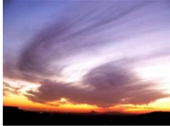
"On The Possibility Of Weather Mod. By Aircraft Contrails" pub 1970