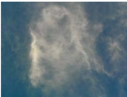
Cloud Seeding in Australia 1946,47,1951