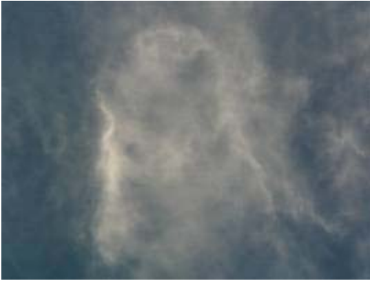
"Artificial Rainmaking In Kansas" 1969