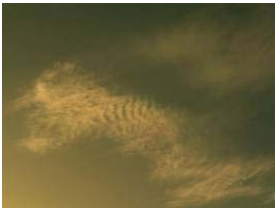
Cloud Seeding In Chile" Pub. 1982