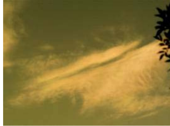
"The NOAA Atmospheric Modification Program" pub 2005