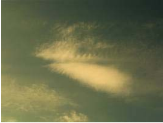
Hail Suppression of The Hudson Valley" 1956-57