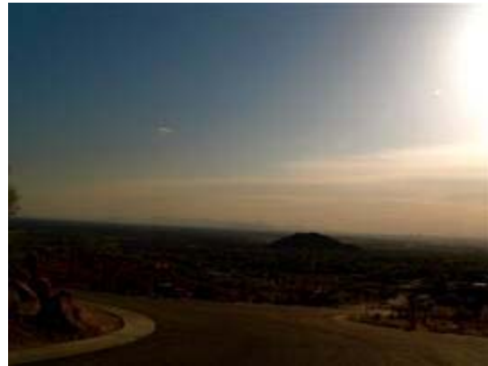
"Seeding Cumulus Clouds in Rhodesia w/Silver Iodide 1968-69"