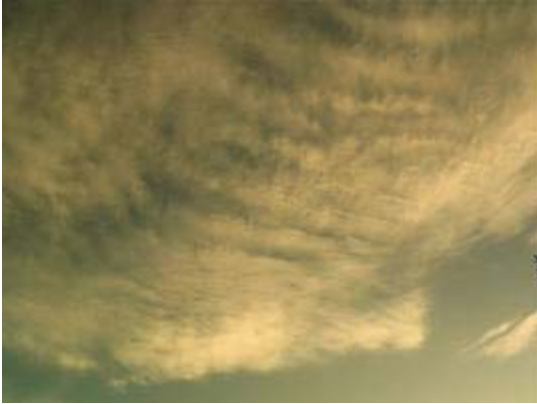
"Comparative Characterizations Of Ice Nuclei Ability by agL Aerosols"