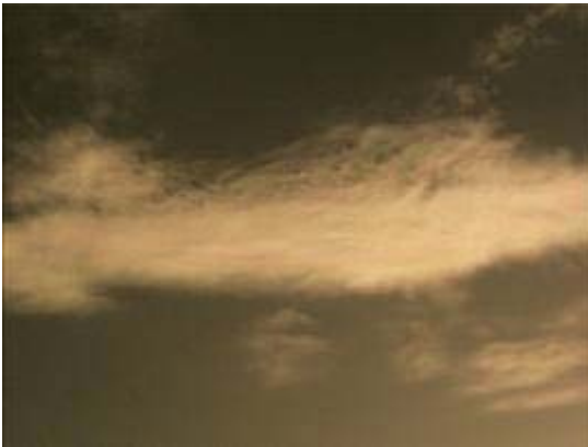
"Weather Modification Reports" 1972-73