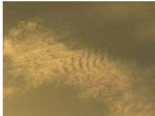
"Weather Modification In Southeast Asia 1966-72"