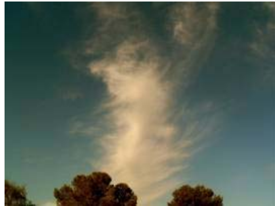
"High Level Atmospheric Program For The New Millenium"