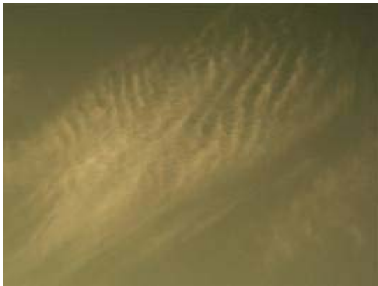
"Ground Based Salt Seeding India 1973-'77