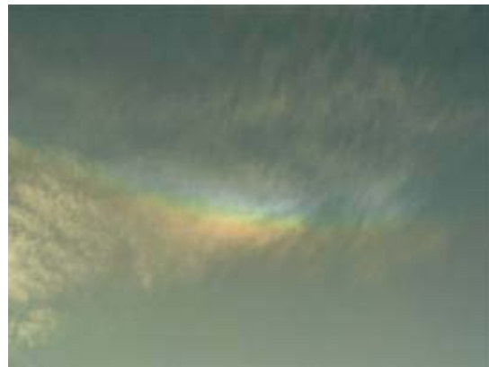
"NOAA's New Thrust In Weather Modification" 1980