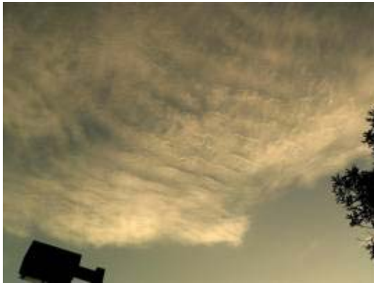
Chaff-Tagging for Tracking Cloud Evolution" pub 1998