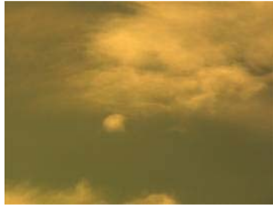
"The Effect Of Ozone On Lead & Silver Iodide" pub 1974