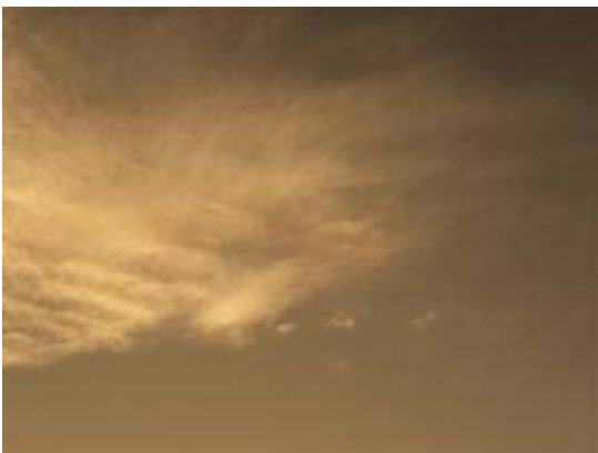
"The Kenya Hail Suppression Program" pub 1974