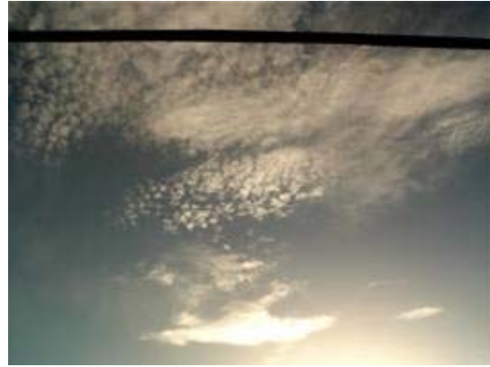
"Trace Silver Analysis in Waters" 1970