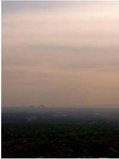
"7 Year Continuous Seeding On The French Atlantic Coast" 1969