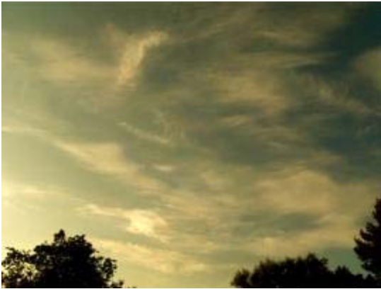
"Artificial Production of Rain In Israel" pub 1974