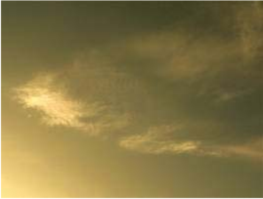
"The Airborne Seeding of 6 Tornadoes" pub.1972