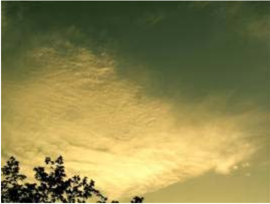
"Hail Suppression In Alberta 1956-68"