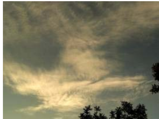
"2031. A Look Into The Future Of Weather Modification"