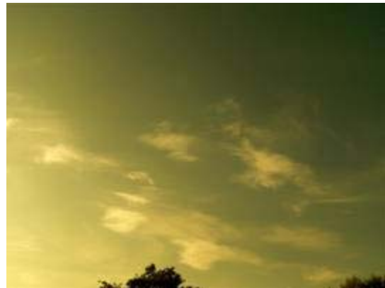
"Increases In Silver Iodide From Ground Generators" Alberta Ca