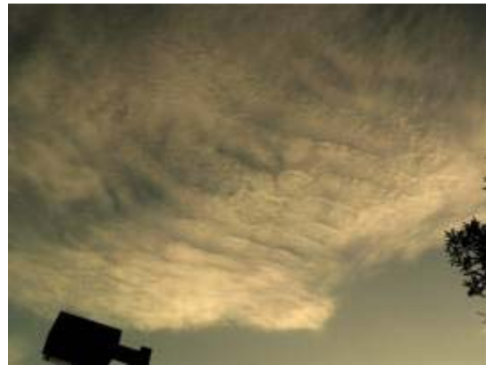
"Cloud Seeding In Libya" pub 2003