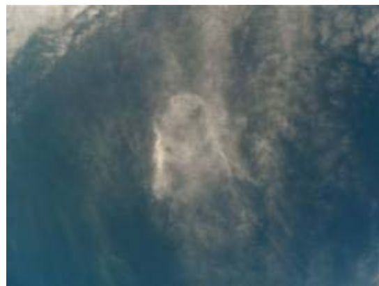
"Cloud Seeding Belgian Congo 1949"