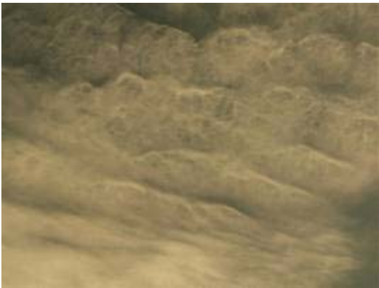
"Cities Can Modify Rainfall-A New Concept" pub 1976