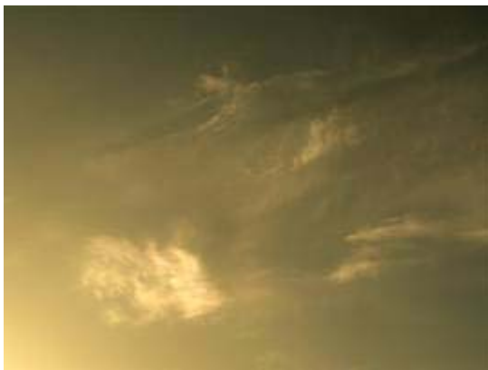
"Weather Modification in Taiwan 1951- 1978"