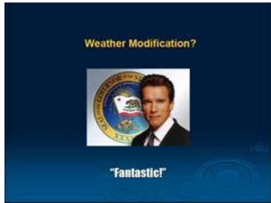
THINK AGAIN!!! (From "Current Weather Modification In California")