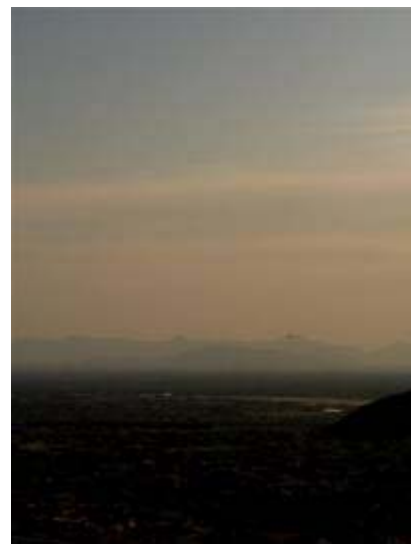
"The Stimulation of Rain in Yugoslavia"