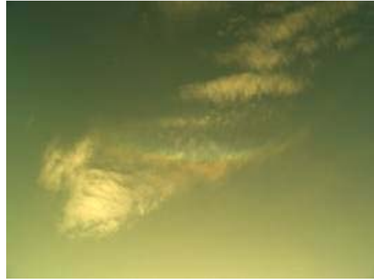
"National Cloud Seeding Operation 1976- 77"