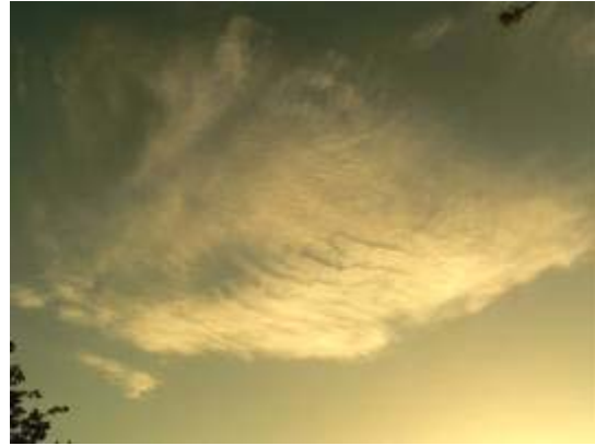
"Swiss Randomized Hail Suppression" pub 1976