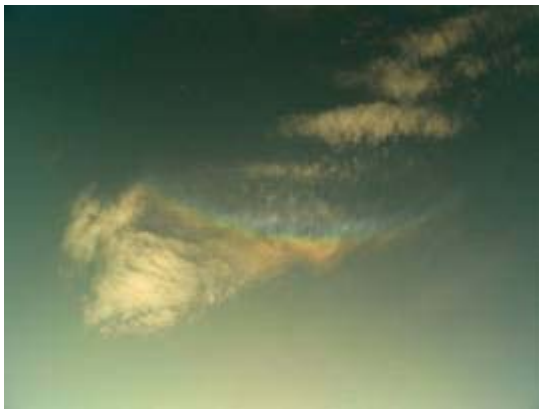
"History Of Planned Weather Mod. Activities" University of Illinois 1947-1976