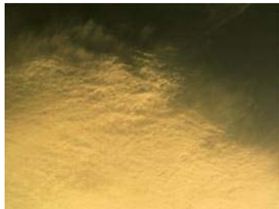
"Seeding Clouds Using Pyrotechnic Cartridges 1973-74"