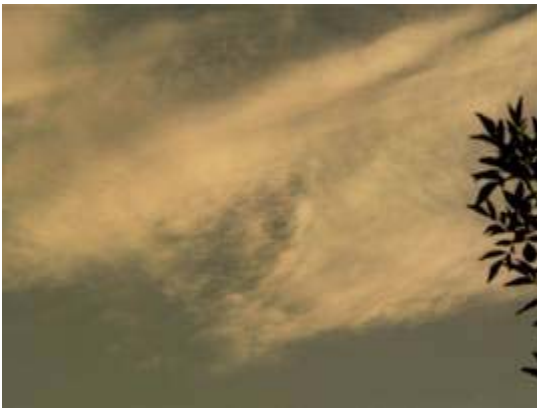
"Black Clouds & Silver Iodide and Public Safety" 1991