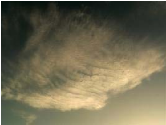
"(Weather Modification) After 29 1/2 Years" pub. 1976