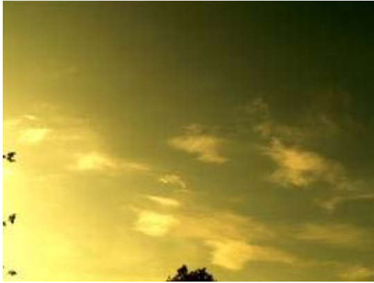
"Silver Content In Soils In N.E. Wisconsin" 1977