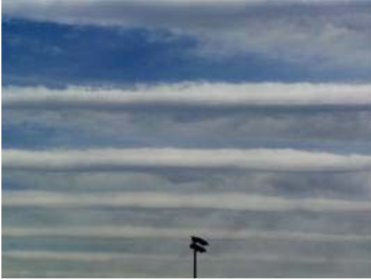
"Rapid Ice Nucleation by Acetone Silver Generator Aerosols"