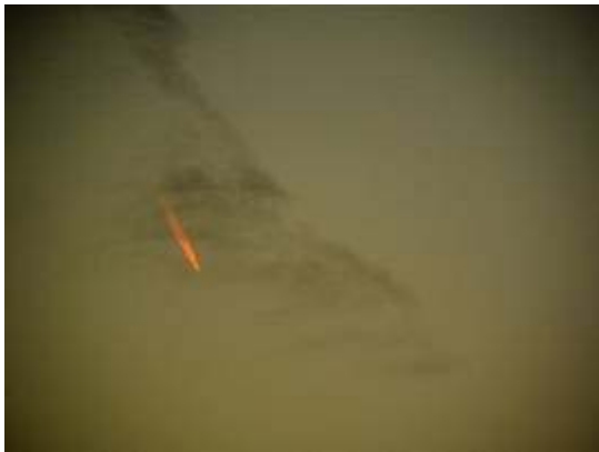
Rain Modification By Cloud Seeding In The Persian Gulf" 1977