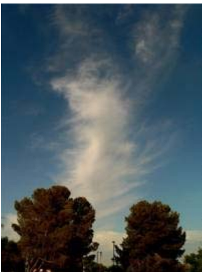
"Acidic Cloud Episodes In The Colorado