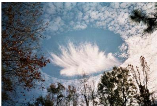
Hole-punch clouds have long fascinated the public.

The key ingredient for developing these holes in the clouds: water droplets at subfreezing temperatures, below about 5 degrees Fahrenheit (-15 degrees Celsius). As air is cooled behind aircraft propellers or over jet wings, the water droplets freeze and drop toward Earth.