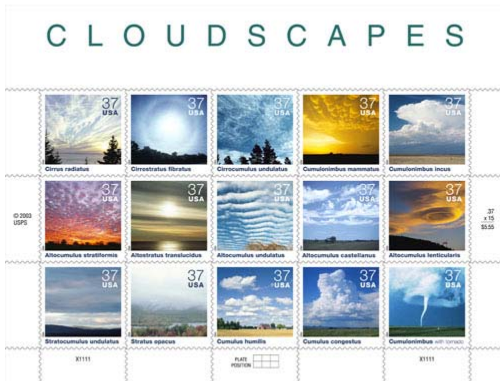
Click on the above image for a larger version.

The celebration, which occurs during National Stamp Collecting Month, includes presentations by photographers and weather experts, book and stamp signings, and guided tours of the Mesa Lab. Nick Carter, 9News meteorologist, will be master of ceremonies. Stamps will be available for purchase and commemorative cancellation at the NCAR Cloudscapes Station, set up by the Postal Service for the day.