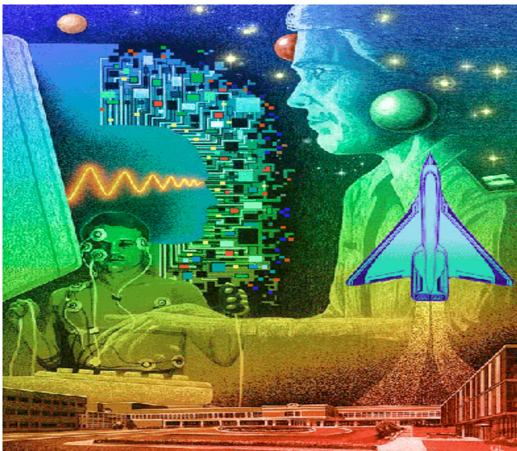
A montage depicting some of the technologies and systems envisioned in the 2025 study.