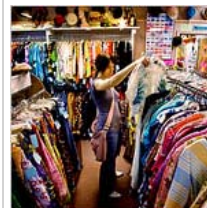
Snowbirds Cast Off Their Inner Fashionistas