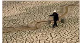
Slide Show Drought Along the Mekong River Enlarge This Image