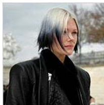
Young Trendsetters Streak Their Hair Gray