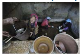
Villagers collected water from a tank in China's drought-stricken Yunnan province. More Photos >

But the drought has also created a major public relations problem for the Chinese government in neighboring countries, where in recent years China has tried to project an image of benevolence and brotherhood.