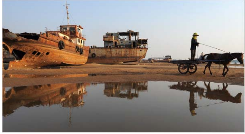
A Cambodian worker transporting sand along the Mekong River. Farmers and fishermen affected by the river's low levels are lashing out at China. More Photos >