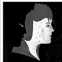
Op-Ed: The Myth of Mean Girls