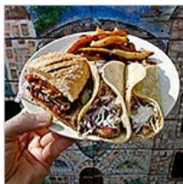
A Weekend in San Antonio