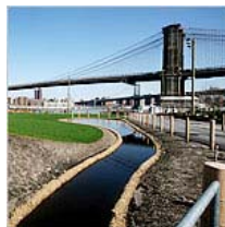
The Greening of the Waterfront