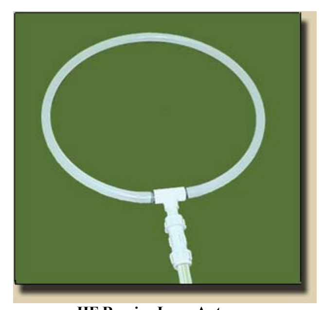
HF Receive Loop Antenna

All Alaska Monitoring of HF waves scattered by HIPAS/HAARP or other Ionospheric Perturbations (Remote Sensing).