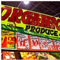
Bloggingheads Video: Is Organic Best?