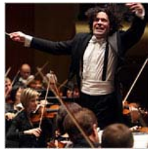
New Los Angeles Driver, on a Joy Ride