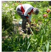
College Paves Plants into Parking