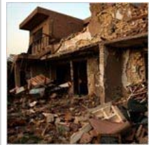
In Baghdad Ruins, Cultural Remains