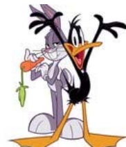
What's Up, Doc? New Looneys