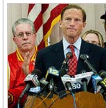
Room for Debate: Why Tell Fake War Stories?