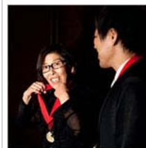
Japanese Architects Receive Pritzker Prize