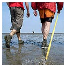
Getting Muddy in the Netherlands