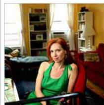
Divorce, Apartment Style