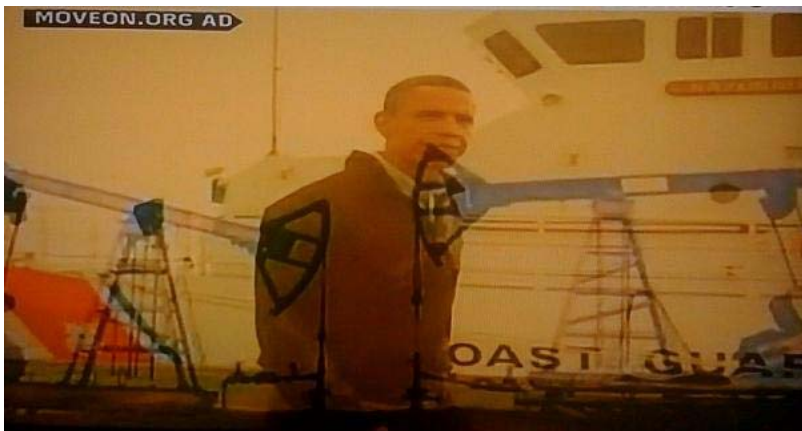
image from Moveon.org ad calling for stop to all new offshore drilling

The admin was warned but it had a political agenda and a government infrastructure still primarily made up of Bush appointees who earned their jobs by blocking regulations