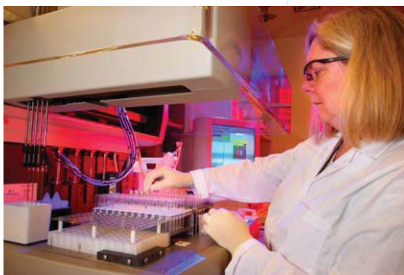
Medical technologist checks samples for vitamin D analysis.

Since 1988, NHANES has monitored the vitamin D status of the U.S. population. By design, this survey collects information and biological samples in the summer from people living at higher latitudes and in the winter from people living at lower latitudes. Because the different racial and ethnic groups are not evenly distributed across all geographic regions in the United States, the season-latitude structure of the survey can affect comparisons by race or ethnicity. In two seasonal subpopulations from NHANES III (1988–1994), Looker et al. (2002) showed that in the winter and lower latitude subpopulation, 1–5 percent and 25–57 percent had 25(OH)D concentrations less than 10 ng/mL (25 nmol/L) and less than 25 ng/mL (62.5 nmol/L), respectively. In the summer and higher latitude subpopulation, 1–3 percent and 21–49 percent had 25(OH)D concentrations below these cutoffs. Mean