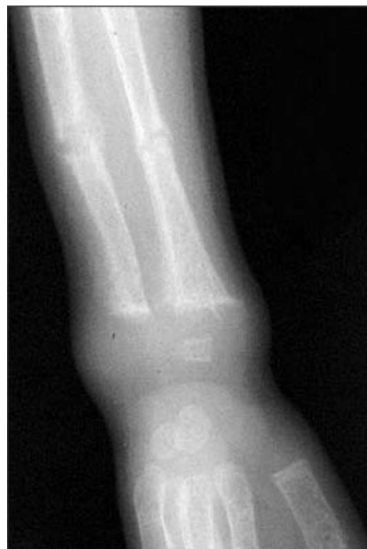
Figure 3. Radiographic image of wrist and forearm showing pathologic fractures of radius and ulna with rachitic changes of distal end of radius and ulna.