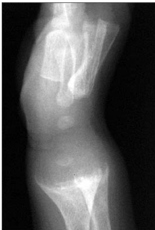
Figure 2. Radiographic image showing typical changes of rickets at the wrist. The distal ends of the radius and ulna display extensive cupping, fraying, and splaying of the diaphysis, with

The infant's gestational age, diet, and degree of sunlight exposure should be noted. A detailed dietary history should include specifics of vitamin D and calcium intake. Researchers have suggested an appropriate amount of sunlight exposure for infants (i.e., 30 minutes per week if only in a diaper and two hours per week if fully clothed), 28 but the exact amount needed for a particular child is not known. It helps to know if the child avoids sun exposure completely. A family history of short stature, orthopedic abnormalities, poor dentition, alopecia, and parental consanguinity may signify inherited rickets.