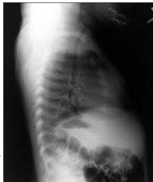
Figure 4. Chest radiograph revealing rachitic rosary (i.e., enlargement of ribs at the costochondral junction).

An anteroposterior radiograph of rapidly growing skeletal areas, such as the knee or wrist, is most helpful in diagnosing rickets. The skeletal changes caused by rickets usually are most pronounced at the knees, wrists, and anterior rib ends (rachitic rosary) 24 ( Figures 2 through 4 ). Classic radiographic findings include widening of the distal physis,