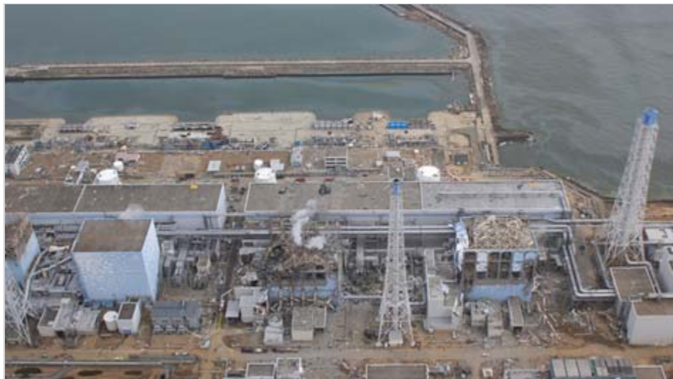
Aerial photo taken by a small unmanned drone, the crippled Fukushima Dai-ichi nuclear power plant are seen in Okumamachi, Fukushima prefecture, northern Japan. From left: Unit 1, partially seen; Unit 2, Unit 3 and Unit 4.