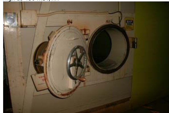
Fukushima Daiichi Unit 2 emergency exit; Image taken on 20 June as reactor building airlock opened

An investigation of the Fukushima Daiichi unit 2 reactor building ground floor and first floor found radiation levels as high as 430 mSv/hr.