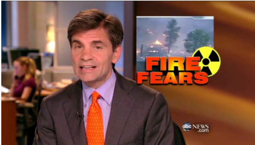
Los Alamos Wildfire Threatens Nuclear Lab