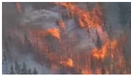
Los Alamos Wildfire Evacuation Watch Video