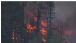
Los Alamos Wildfires: Detectors Checking the Air Watch Video