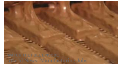
WATCH THE FULL EPISODE World News: Manufacturing Jobs