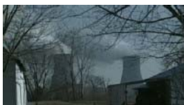
Nuclear Plant Evacuation Concerns Watch Video

Against Clean Coal? Understand the benefits. Learn the truth, read the facts. We can help. AmericasPower.org