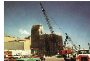
Demolition of a Reactor Containment Building

The licensee may also choose to adopt a combination of the first two choices in which some portions of the facility are dismantled or decontaminated while other parts of the facility are left in SAFSTOR. The decision may be based on factors besides radioactive decay such as availability of waste disposal sites.