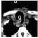
Thyroid Cancer - CT Scan