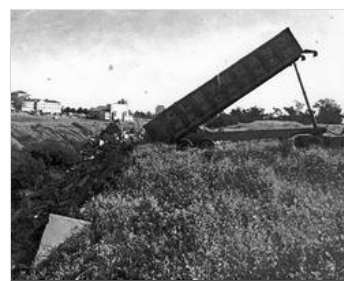
Circa 1970s- Dumping into unlined VA ravines and lands adjacent to Brentwood went on for decades.