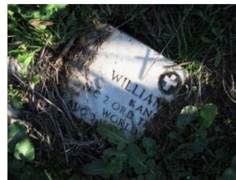
A discarded grave marker unveiled by soil erosion at the old dump. Strict rules governing how to discard military gravestones went ignored.