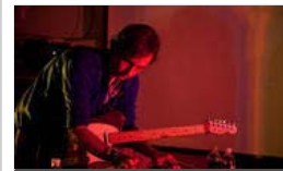
Deakin @ Eagle Rock Center of the Arts