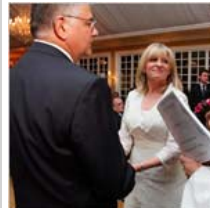
Weddings and Celebrations