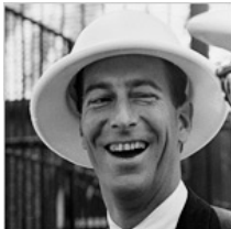
Op-Ed: City of Earthly Delights