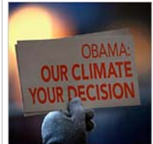
What's Rotten for Obama in Denmark

Home | World | U.S. | N.Y./Region | Business | Technology | Science | Health | Sports | Opinion | Arts | Style | Travel | Jobs | Real Estate | Automobiles | Back to Top