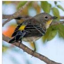
The Ventriloquist Bird and Monkey Syntax