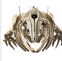
A Whale of a Return to MoMA