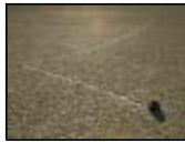
23 Creepy, Unexplained Phenomena