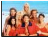
Where Are 'Baywatch' Stars Today?