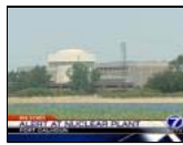
Smoke Causes Scare At Nuclear Plant