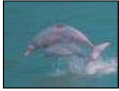
Pink Dolphins Frolic In Hong Kong Waters