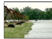
Fort Calhoun Residents Head To Higher Ground