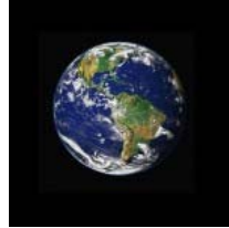
Planet Earth

Meanwhile, as stated above, Parliament, aware of these proposals advises against public debate on what should be the greatest debate human discussion since Adam's decision to leave the Garden of Eden! The question is whether we wish to live in a natural world, or an engineered planet pumped full of megatons of sulphur and heavy metals. That debate ought to have free reign to question motives and the "science" behind it, lest the military's stated goal of owning the weather provide them motivation to provide us a false narrative. It is this author's opinion that the burden of proof should be on the perpetrators, not the general public. In a massive expression of irony, London recently imposed emissions caps on heavy vehicles driving into central London. Could it be that said industrialists failed to invest in clean engines because they have been taxed out of existence to pay for black projects like geo-engineering and, bailouts of the fraudulent shadow banking system which they had no idea even existed?