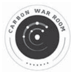
The Carbon War Room

SRMGI was funded by the three convening organisations, and by contributions from: