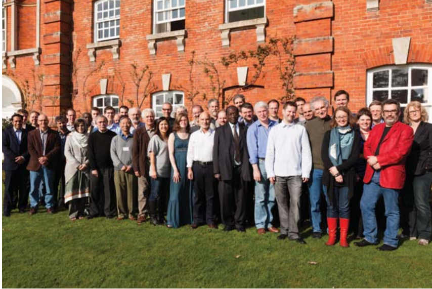
The participants of the March 2011 SRMGI conference, held at the Kavli Royal Society International Centre, Buckinghamshire, UK.