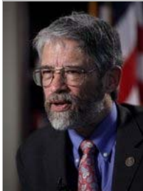
John Holdren talks about his role as President Obama's science adviser...