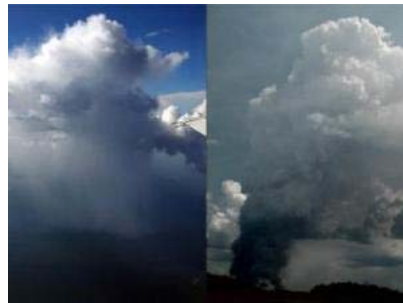
Smoke from agricultural fires suppresses rainfall from a cloud over the Amazon (right). A similar size cloud (left) rains heavily on the same day some distance away in the pristine air.

On the other hand, there would be no cloud droplets without aerosols. Some of them act as gathering points for air humidity, so called condensation nuclei. On these tiny particles with diameters of less than a thousandth of a millimeter the water condenses – similar to dew on cold ground – releasing energy