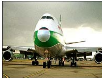
The aviation industry wants to cut its emissions

UK scientists say this would result in a 47% reduction in contrails, the exhaust streams produced by aircraft.