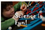
Science is Fun!