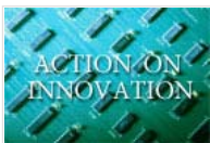
Action on Innovation