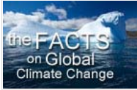
Facts on Global Climate Change