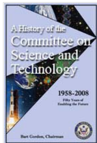
History of the Committee