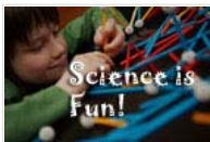
Science is Fun!