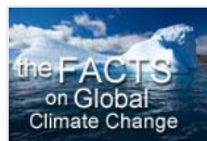
Facts on Global Climate Change