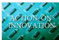
Action on Innovation