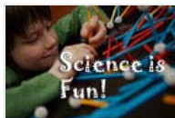
Science is Fun!